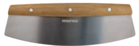
Morsø Pizza- & Herb Cutter