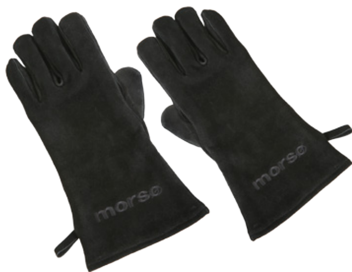
Morsø Grill Gloves R/L