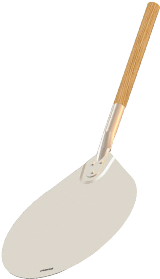
Morsø Peel - alu pizza shovel