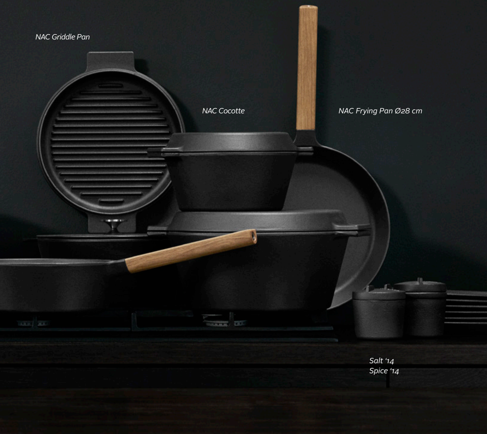
Salt '14 Spice '14