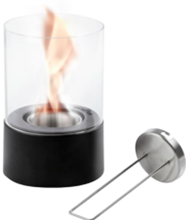
Morsø Bel - bio-ethanol lamp