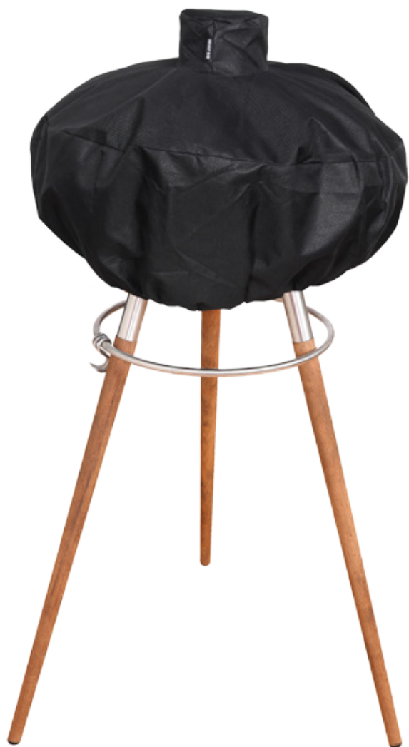
Grill Forno Cover