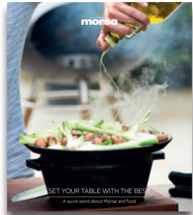
Morsø Outdoor Cookbook