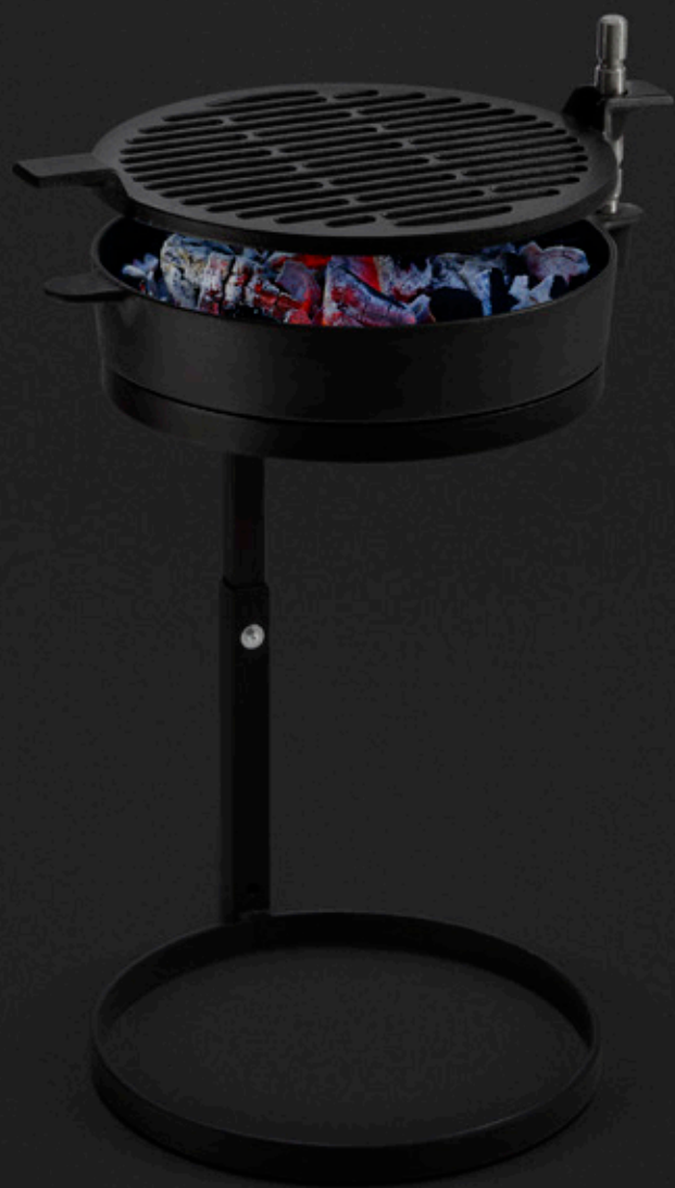
Morsø Grill '71 Designed by Morsø