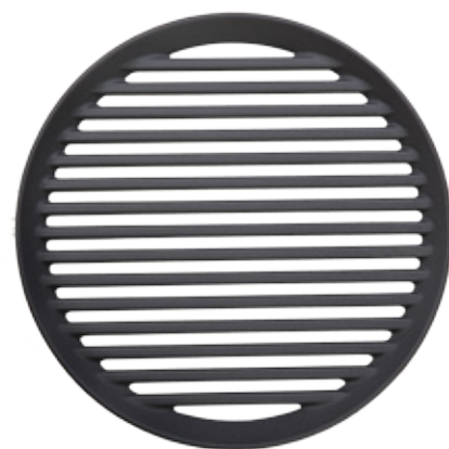
Cast-iron inserts for Grill Forno