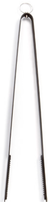
Morsø Fire Tongs