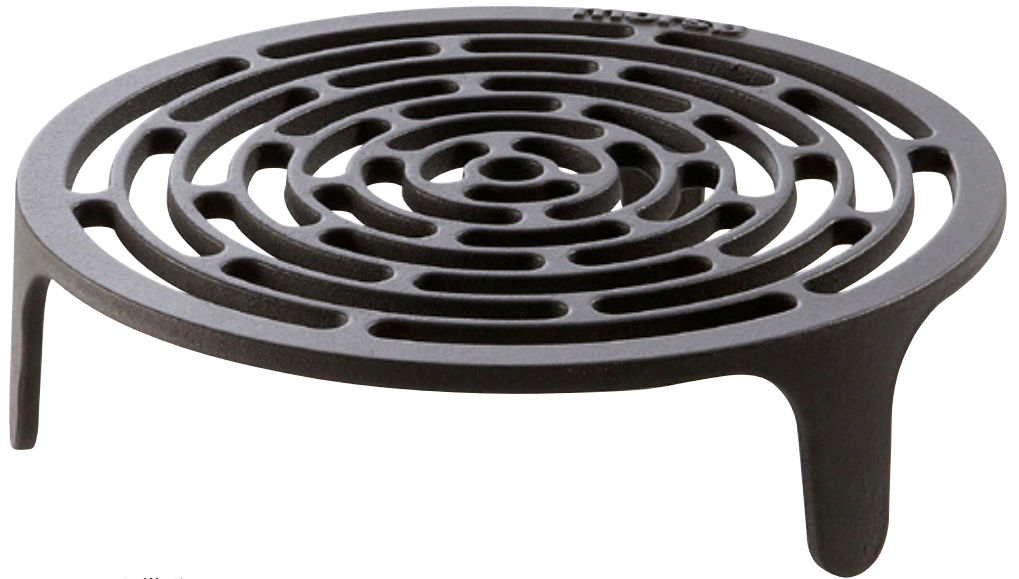
Morsø Tuscan Grill Ø34 cm