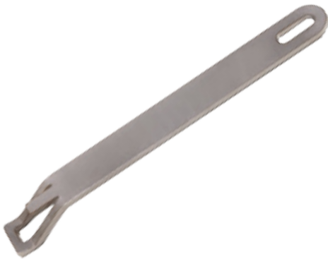
Morsø Handle for grill grate/grill plates