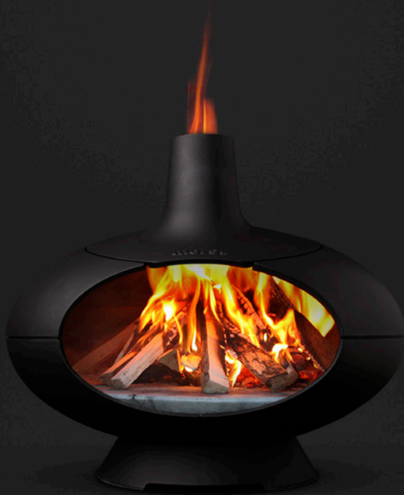
Morsø Forno Designed for Morsø by Klaus Rath