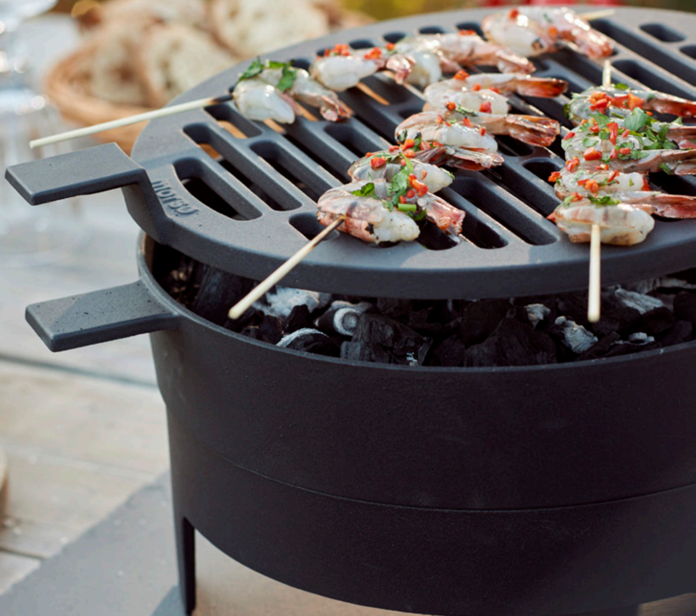
Morsø Grill '71 Table Designed by Morsø