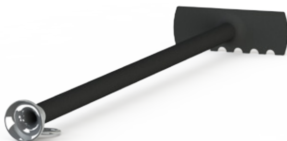
Morsø Ash Scraper