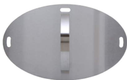
Morsø Grill Forno Door