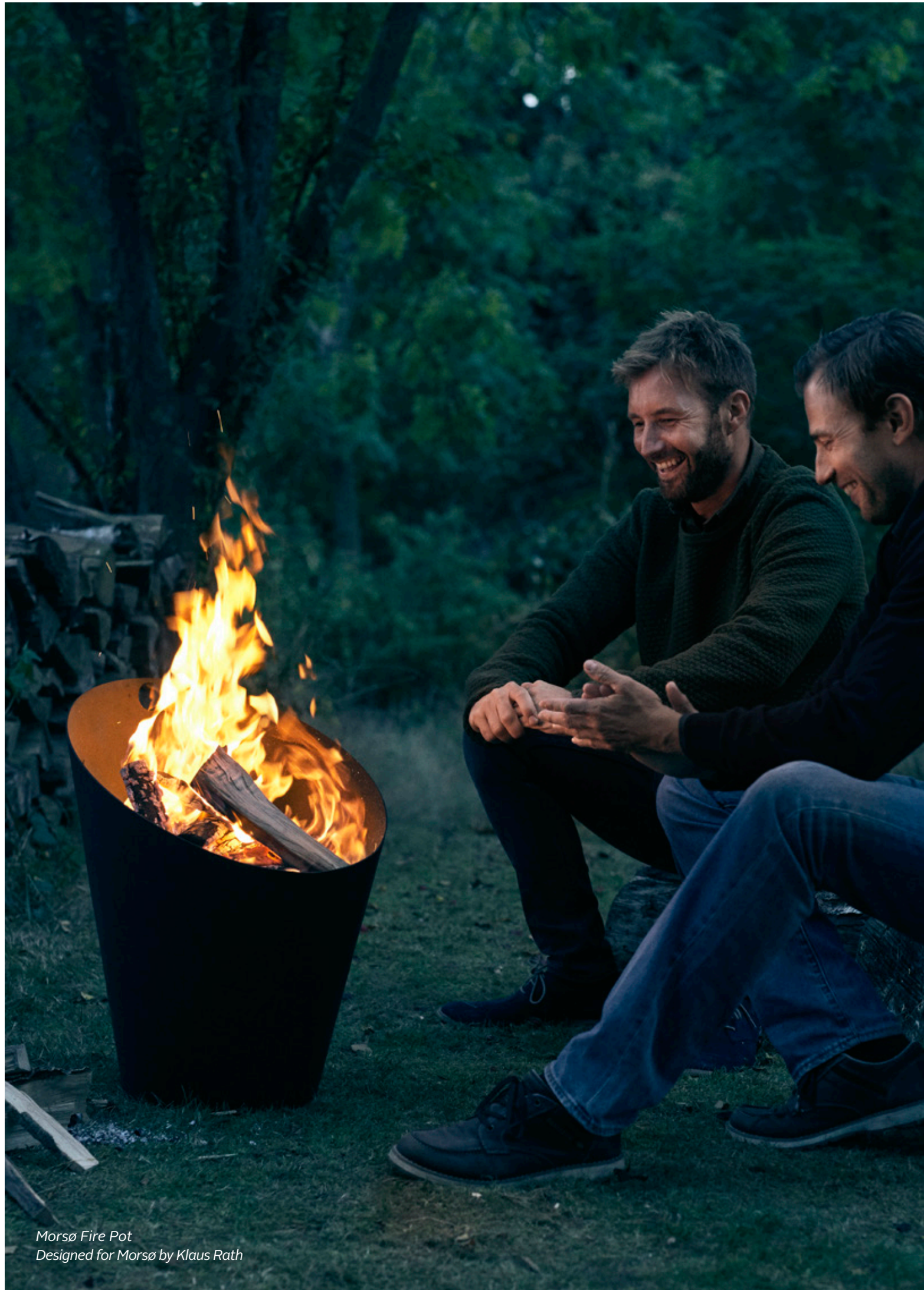
Morsø Fire Pot Designed for Morsø by Klaus Rath