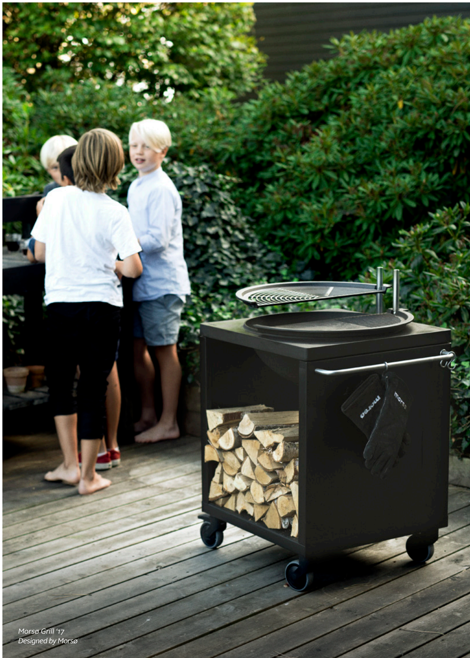
Morsø Grill '17 Designed by Morsø