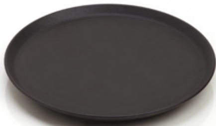
Morsø Frying Dish Ø32 cm