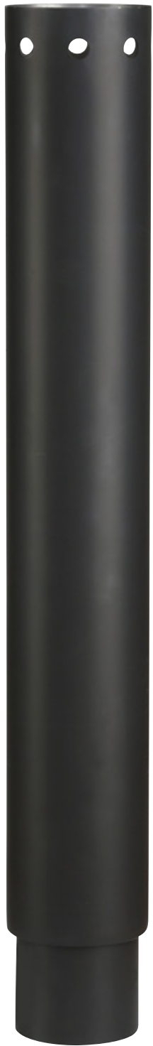
Morsø Forno Flue Pipe