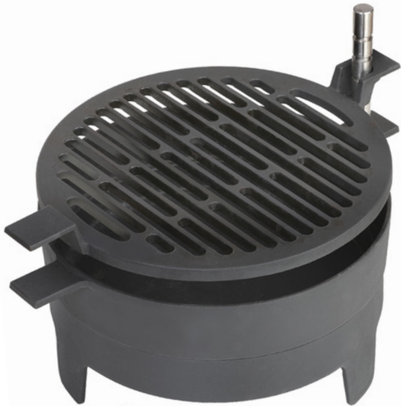
Morsø Grill '71 Table