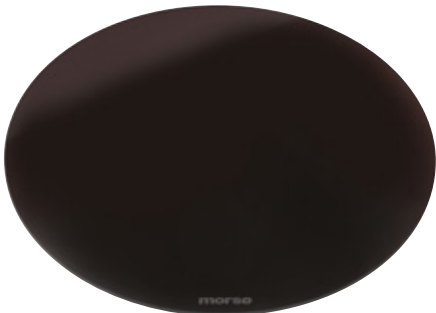
Morsø Vetro – Pizza- & Fryingplate