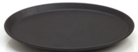
Grill Plates - 2 pcs