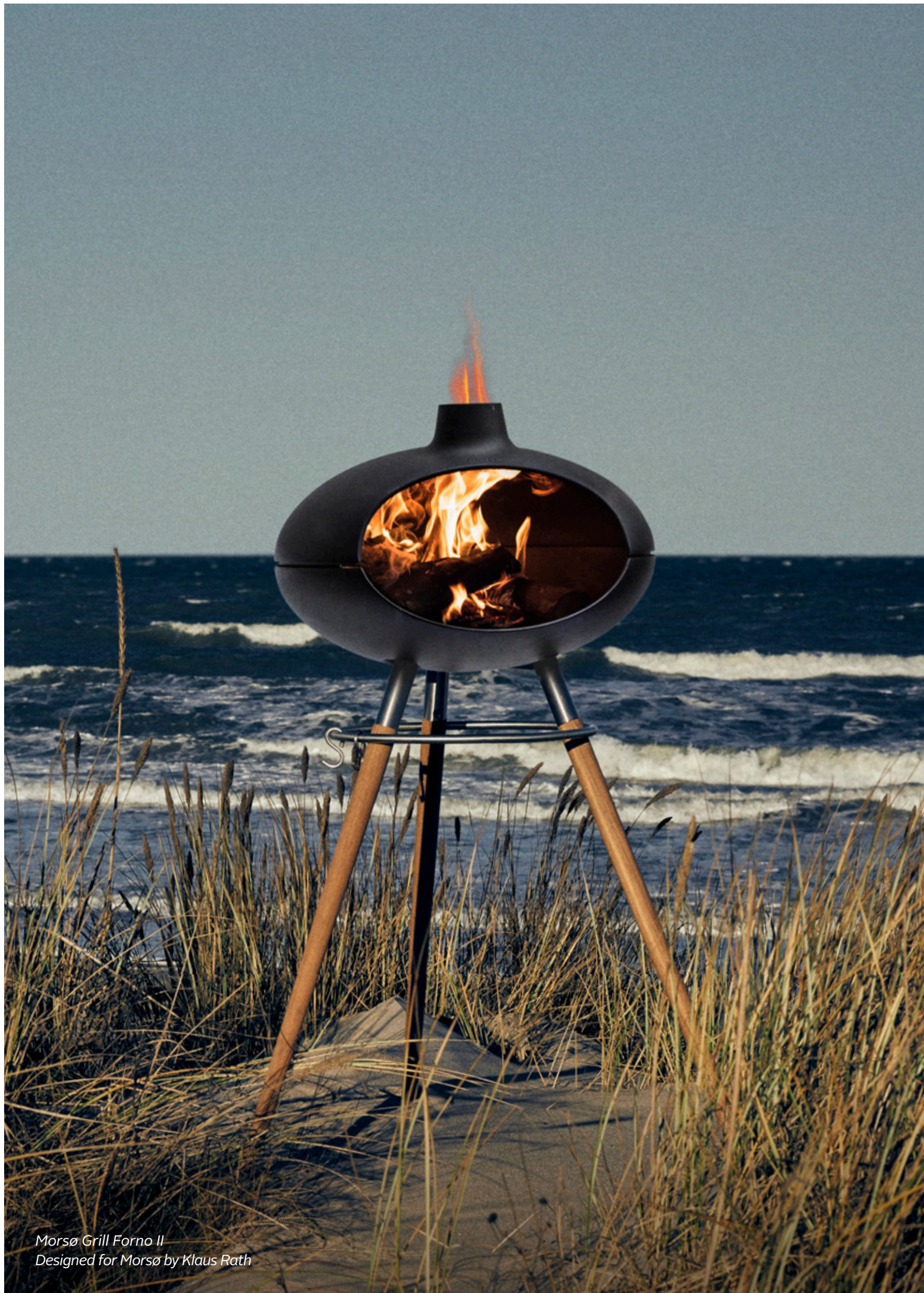
Morsø Grill Forno II Designed for Morsø by Klaus Rath