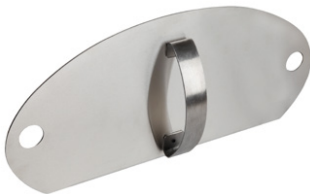
Morsø Forno Door