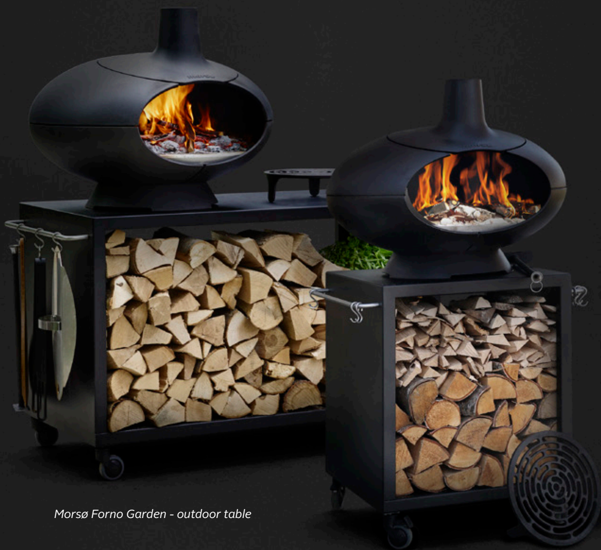
Morsø Forno Garden - outdoor table