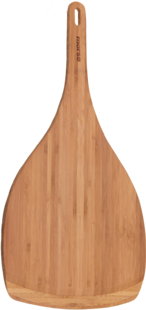
Morsø Paddle - bamboo pizza shovel